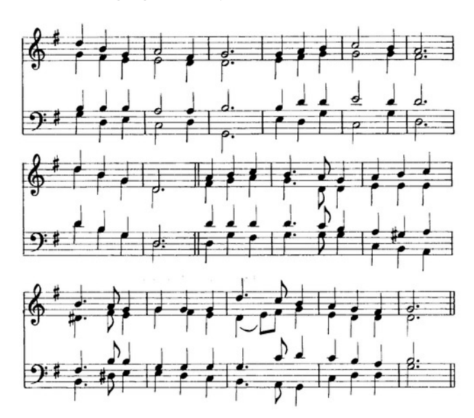
HYMN NEH 466 Thou whose Almighty word The congregation may hum with closed mouths

WILL magnify thee, O Lord, for thou hast set me up: and not made my foes to triumph over me. O Lord, my God, I cried unto thee: and thou hast healed me.