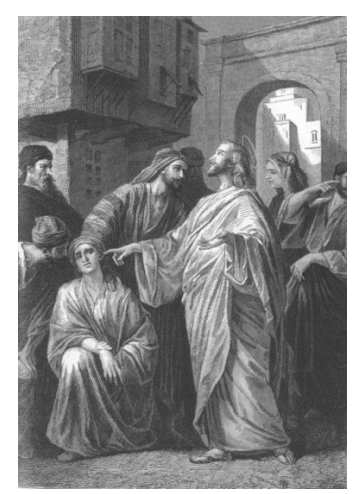
Alexandre Bida Jesus healing the deaf and dumb man of Decapolis

https://www.youtube.com/watch?v=ncNaHtUPDs8