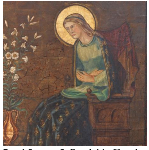
Godfrey Gray The Annuciation; paintings on the Rood Screen, St Botolph's Church