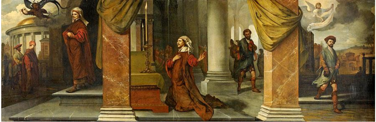
Barent Fabritius, The Pharisee and the Publican 1661; oil on canvas - Rijksmuseum

Dutch artist Barent Fabritius painted the parable of the Pharisee and the Publican commissioned by and hung in the Lutheran Church in Leiden. The centre section between the columns depicts the moment of the two prayers. The Pharisee's face is lifted up and illuminated as he kneels before an altar. His gesture points towards himself and to the Publican. He talks to God about himself and what he has not done – robbing others, doing evil or committing adultery. The tax collector stands in the shadow behind a column, his face turned down knowing he is a sinner and unable to lift his eyes to heaven. He knows he must pray with humility, ask God to forgive his sins and show him mercy.