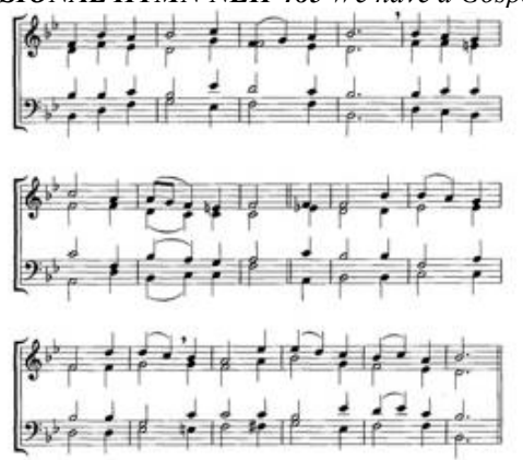
THE RECESSIONAL HYMN NEH 485 We have a Gospel to proclaim